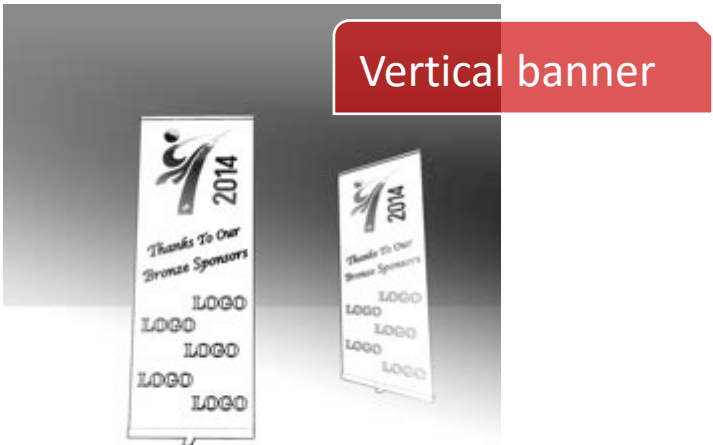
Logo on Banner