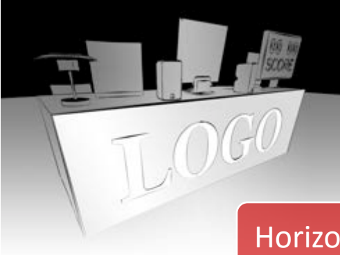
Logo on Table banner